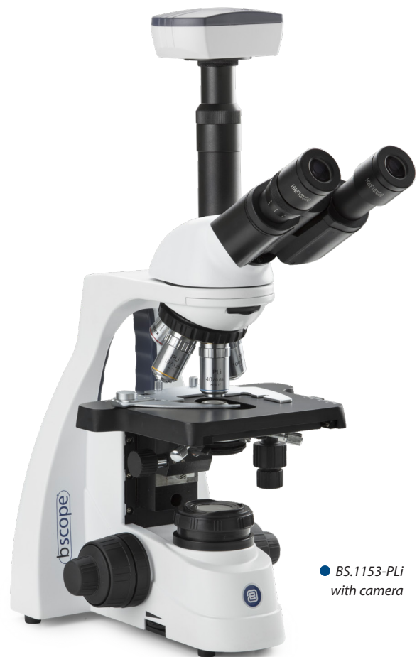
● BS.1153-PLi with camera